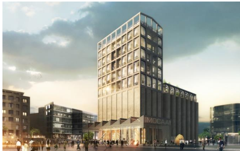
Pic.4. Zeitz Museum of Contemporary Art of Africa, Cape Town

The museum will be opened this year. It is created around the building of the former granary, built in the 1920s. The museum area will be 9,500 m 2 , it will be divided into 9 floors, 6,000 m 2 will be allocated for exhibition space.