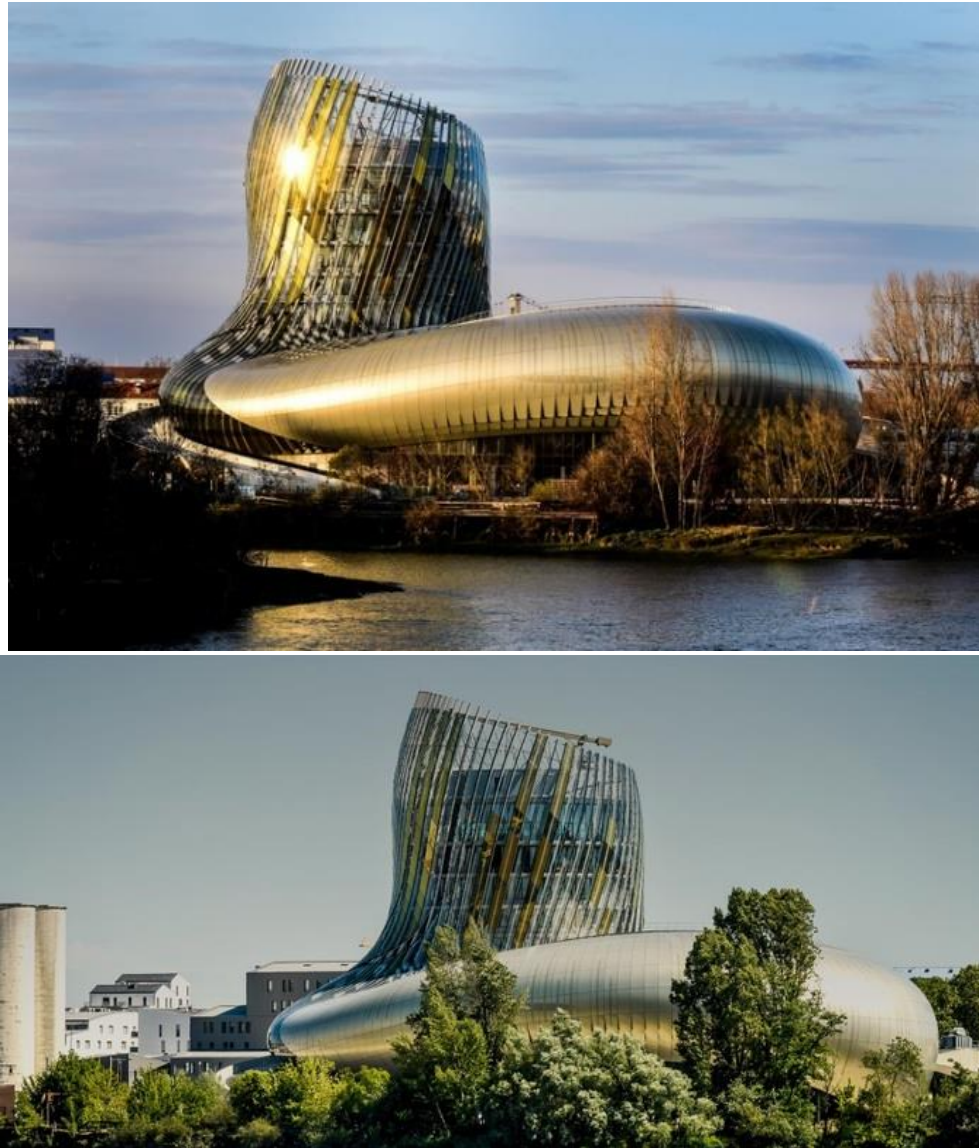
Pic. 3. “Bordo” Wine Museum

As it is written on the museum's website, "this is a unique cultural object where wine comes to life through an exciting, sensual approach embodied in expressive architectural design." The shape of the building resembles a splash of wine in a glass or the waves of the Garonne River, on the banks of which the museum is located. The bold architectural design impresses with its shape of curves embodying a wave, a fluid in motion. The museum building with an area of 13,350 m 2 reaches a height of 55 meters. Minimize the impact on the environment. It receives 70% of its energy needs from environmentally friendly sources.