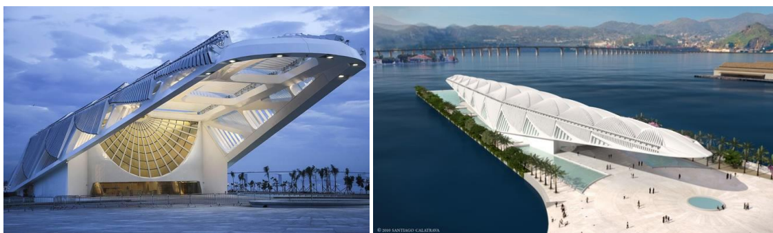
Pic. 1. Museum of the Future in Rio De Janeiro

Modern museums are not like traditional ones. Boring rooms with dust-covered exhibits are a thing of the past, and they are replaced by interactive exhibitions and non-standard presentation of material. But now we want to talk about the buildings, they are worthy of attention and admiration no less than the museum's exposition.