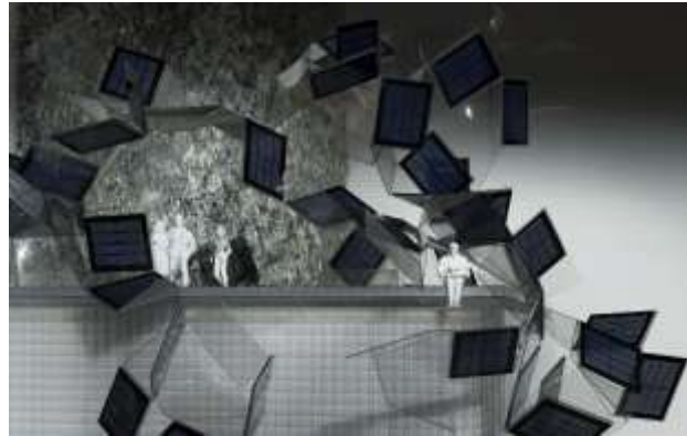
Figure 1. Installation of Energetic Energies. Solar panels have a certain shape - rectangular. In this case, polycrystalline photocells of solar panels are a rectangle or square, and monocrystalline ones are a square with beveled corners. They are more fragile, and this shape allows you to avoid a large number of defects in production - chipped corners. Solar panels on a thin-film basis can theoretically be of any

The smallest solar panels are those made of thin-film cells. For example, architect Akihisa Hirata created the installation Energetic Energies for Milan Design Week 2013, composed of thousands of small solar panels with an area of 30 cm 2 (Fig. 1).