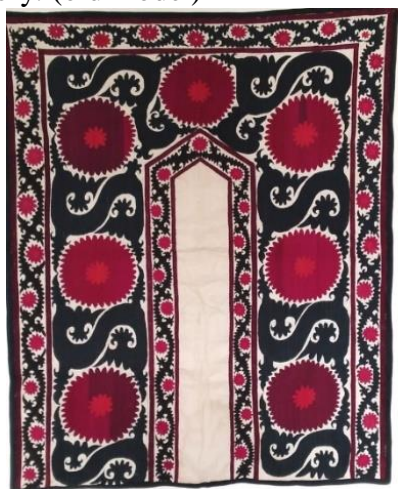
Samarkand embroidery (ancient pattern) Sources of the fund of the Samarkand State Museum. O.Sukhareva collections.( KP-436 )

In addition, the images attract people with their simplicity, bright and clear colors, graceful stitching, reflecting the traditions, beliefs and spirituality of Uzbek people. In particular, Samarkand embroidery has a special significance in Uzbek embroidery due to its bright colors, sewing style and variety of products. Samarkand embroidery. (old model)