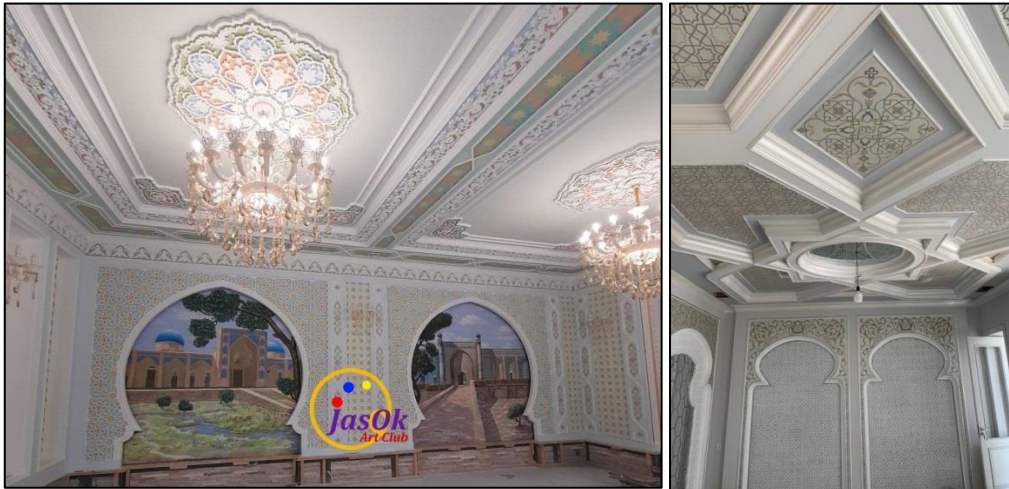
Figure 2. An example of a Ganch used in the interior of a residential area around the city of Kokand. Gypsum -Ottocento, Venetian decorative finishing material

Nowadays, plasterers use gypsum instead of plaster. Gypsum is a white, colourless, transparent, dark or dark coloured mineral. It is very brittle and soluble in water. When heated to 80-90 °C, the water evaporates. If heated to 120-140 °C, it turns into alabaster. It is a building material; It is also used in the paper and cement industries, medicine and sculpture, and in carving and painting. Gypsum is water-resistant. To protect it from gypsum, the waterproof cover is painted with paste or paint. Gypsum is used to make drywall, barrier tiles, floor coverings, cornices, soundproofing materials, and fireproofing. [3,12,19]