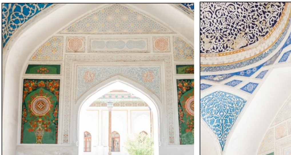
Figure 1. Ganch slab, made for the interior of Khudoyar Khan's Horde. XIX century.

Let's take a look at the researchers' descriptions of ganch and ganch masters. Ganch is a local building material that is blue or yellow in colour. Ganchturli is referred to by different names in different places. In the Caucasus it is called "gaja", Persian "gaj", Tajik "ganch", Turkish "urunak", Uzbek "ganch". Gypsum is a natural mixture of gypsum and soil, containing 40 to 70 per cent gypsum. There are two types of ganch: natural and artificial [22-29]. Natural gypsum is found in large boulders and is used for carving, carving, sculpture and decoration. Artificial gypsum is heated in special ovens and then crushed. In ancient times, ganch makers were known as ganch makers. Plasterers make a mixture of gypsum (glynogips) in several ways and emboss the pattern on the wall with the help of special plastering equipment. Gypsum raw material is one of the oldest local building materials and is widely used in exterior and interior decoration. It has been used as a lifelong building material without losing its character. But today, since the end of the twentieth century, the work of plasterers has been facilitated by the development of new building materials [31-35].